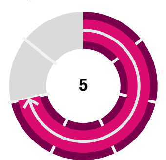
Larger values (up to 7) indicate higher risk while lower values (up to 1) indicate lower risk