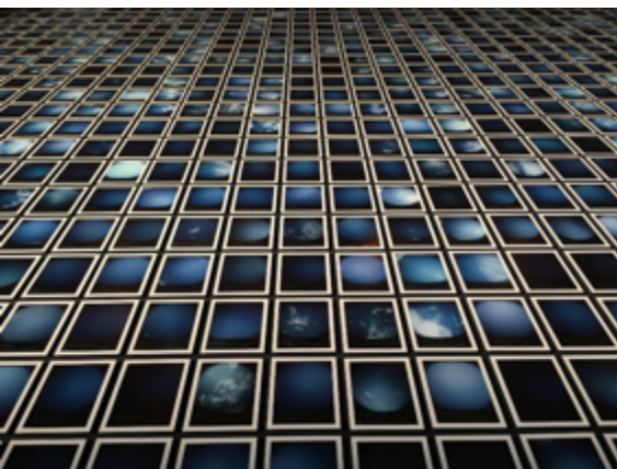
Image 9 Anton Kusters The Blue Skies Project Fitzrovia Chapel, installation view, 2019 © Anton Kusters