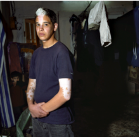
Image 5 Mohamed Bourouissa BLIDA 2 , 2008