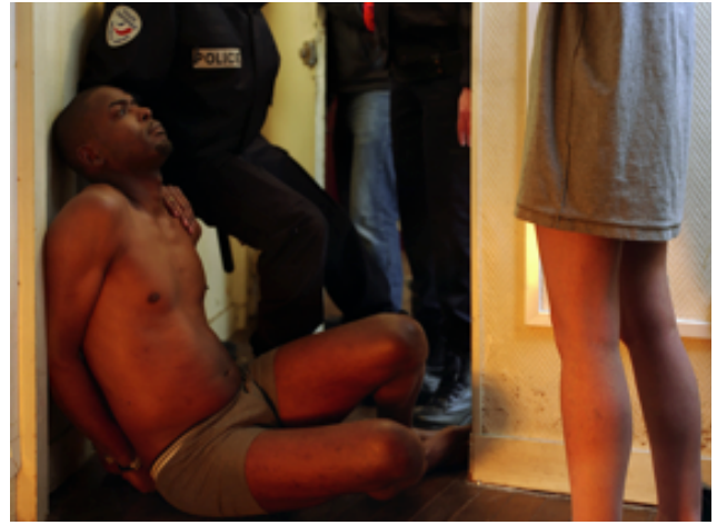
Image 6 Mohamed Bourouissa La Prise , 2008 From the series PERIPHÉRIE