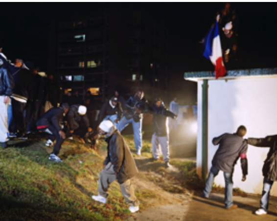
Image 7 Mohamed Bourouissa La République , 2006 From the series PERIPHÉRIE © Mohamed Bourouissa, Kamel Mennour, Paris & London and Blum & Poe, Los Angeles